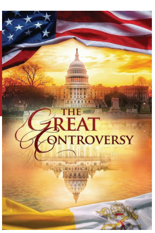
Limited supplies. Please order only for yourself.

We respect your privacy and won't share your personal information.